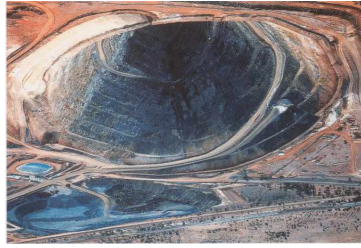
HIGH RAMPING ?