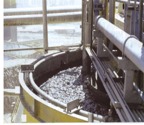
PASTE TRANSFER ?