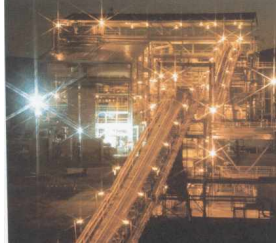
PROCESS CONVEYING ?